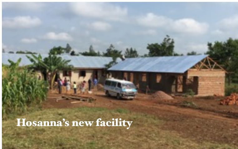
Hosanna's new facility

education. Scholarships were offered on a term-by-term basis, with an extension of a scholarship requiring top grades from the student. We feel that this will reinforce and reward hard work and prepare students to enter the labor force with a strong work ethic.